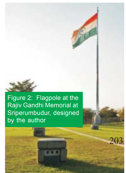
Figure 2: Flagpole at the Rajiv Gandhi Memorial at Sriperambathur, Chennai, designed by the author